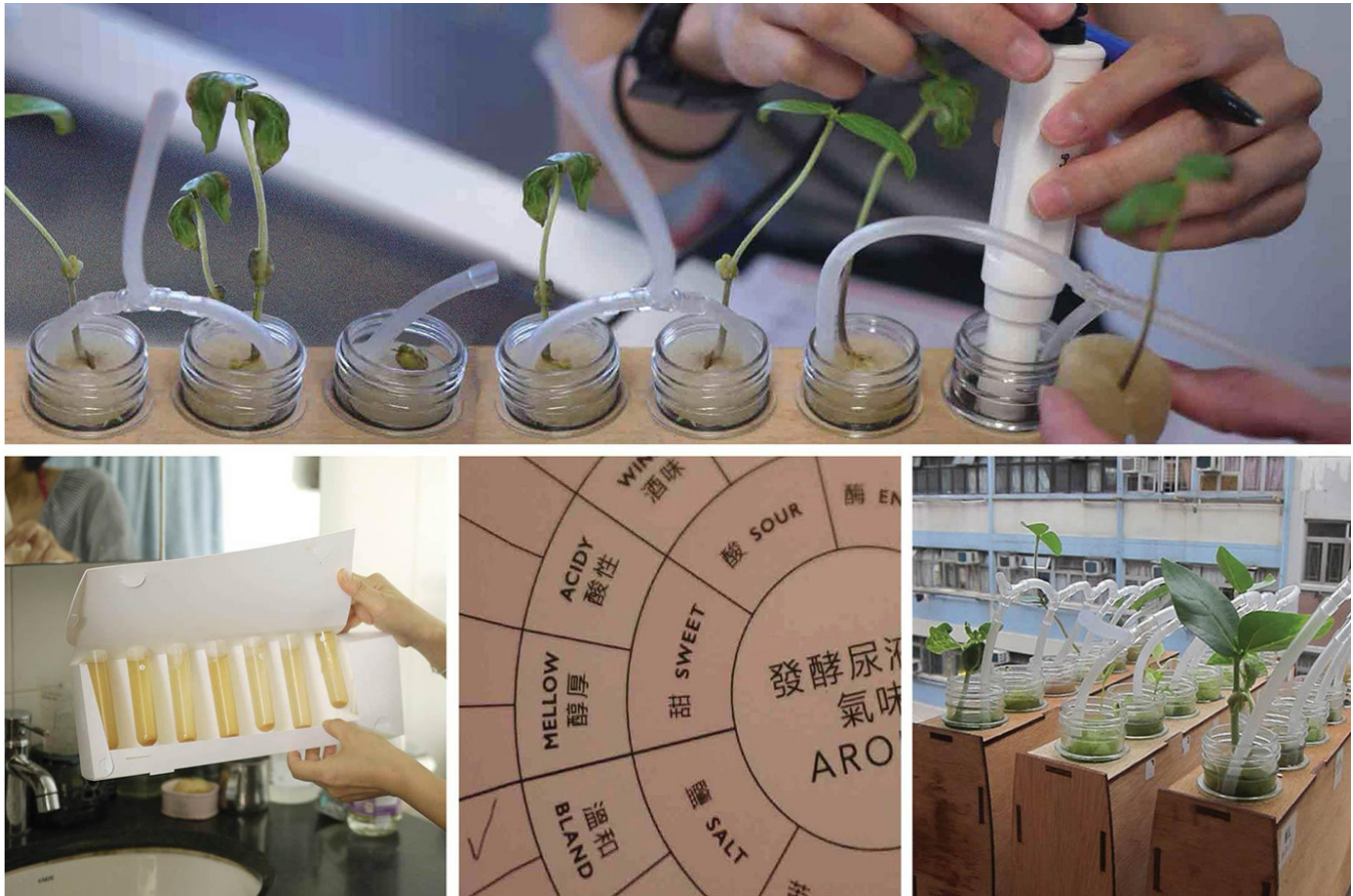
Figure 1. ANTHROPONIX relied on self-devised, lactic acid fermentation for stabilizing daily samples of urine and on monitoring instruments like an electrochemical measurement device and aroma reference chart to use human urine at home in a water-based solution for growing plants out of it.

evaluating experiences from the shared project journey. The volunteers were asked to record dietary intake, sleep patterns, urine testing, and plant growth markers in an elaborate ‘Journal of Mutual Flourishing.’ The entries were discussed at the beginning of each of the five group workshop sessions, and the journaling was complemented with exchanges on the WhatsApp group, audio-visual workshop documentation, observations, and field notes. Data are described in detail in Table 2 .