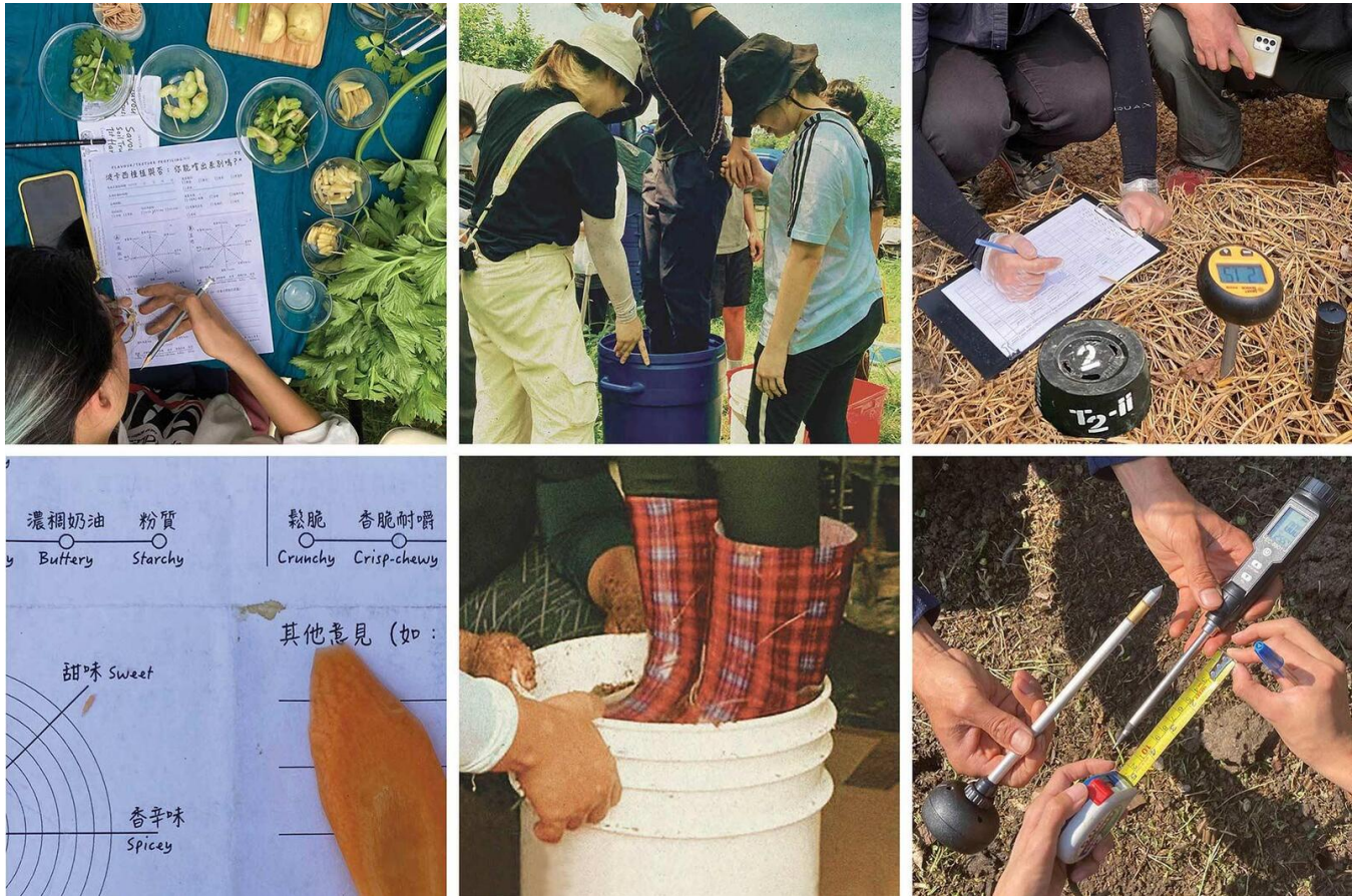
Figure 5. Volunteers feel soil through gustatory sensing to taste the emergence of trace minerals at comparative blind tastings of the harvest and remove air pockets during Bokashi bedding preparation with proprioception in addition to participatory citizen science to follow soil health.

lizards with an infusion of relatable personhood or witty admiration in the WhatsApp group. These vocabularies formed a vital part of the projects. Holobiotic relationships affect us in many ways, but they are not usually something we pay much attention to because we lack the language needed to talk about them. The consequential mattering and noticing together achieved by recirculating waste synergistically to work alongside terrestrial ecosystems prompted some volunteers to relate to soil as a fellow laborer. It raised questions about who counts as a worker and about appropriate social relations, care, and restitution toward nonhuman life forms, which opened ecological perspectives. This is especially relevant in extremely densely populated cities like Hong Kong, in which many of these relationships are hidden and engineered away or only learnt at the abstract level through conceptual frameworks taught in high schools and in universities. It is important to note, however, that this paper has dealt with what can best be called lay holobiontics. Lay holobiontics was partly individual but mostly shared among the volunteers. The shared experience of recirculating nutrients locally and synergistically from what is released by one's body, kitchen, or field, while collaborating alongside the growth medium, was formative for all volunteers.