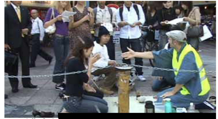
At Your Service (Mobile Tea Ceremony) Kyoto, Japan 2006