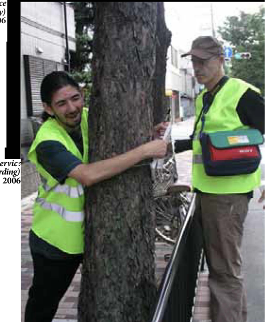
At Your Service? (Tree Guarding) Kyoto, Japan 2006